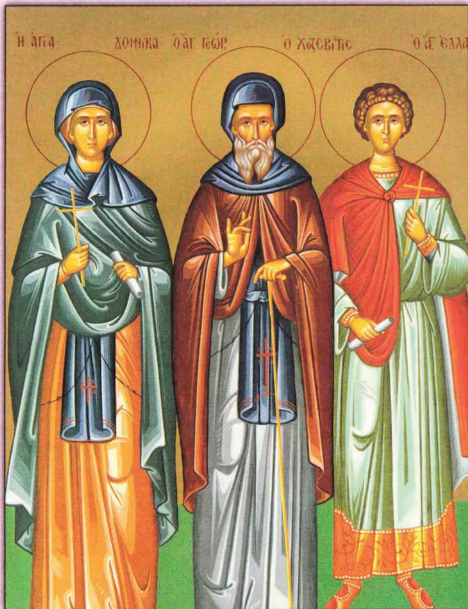
Icon of Saints George, Dominika and Elladius -- January 8th