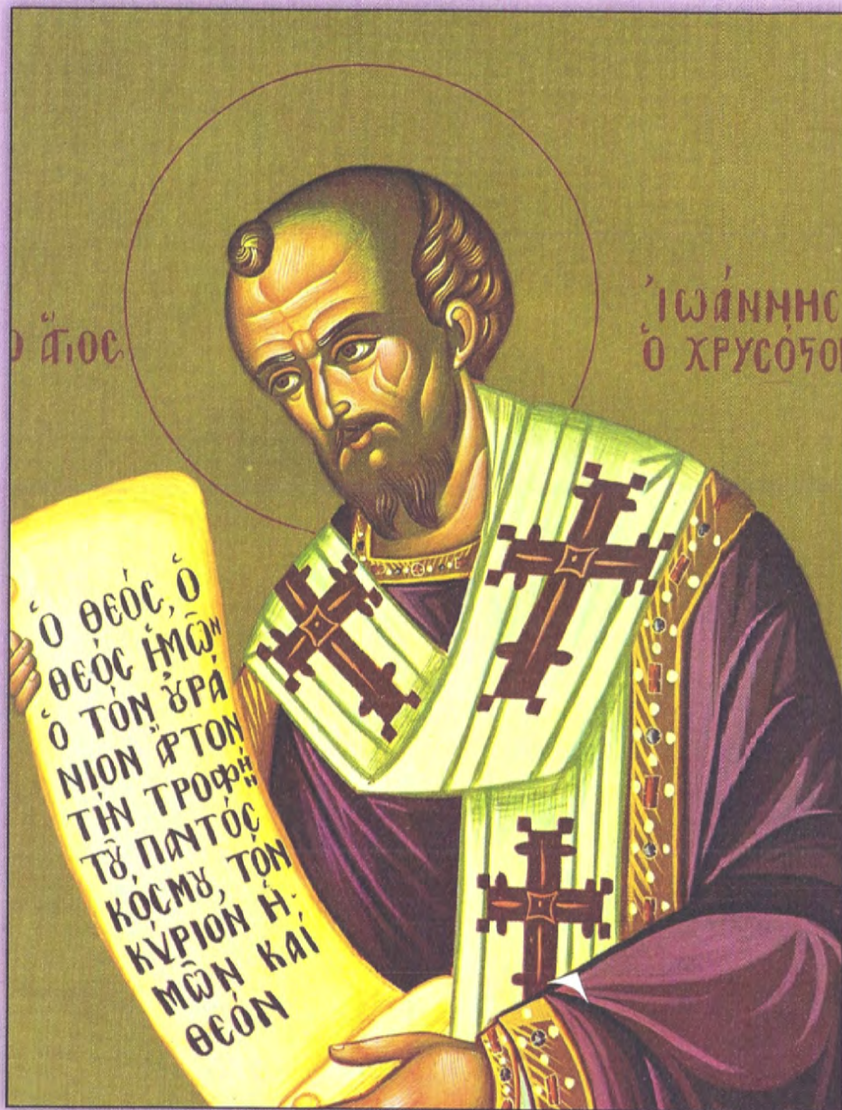
Icon of Saint John Chrysostom -- January 27th