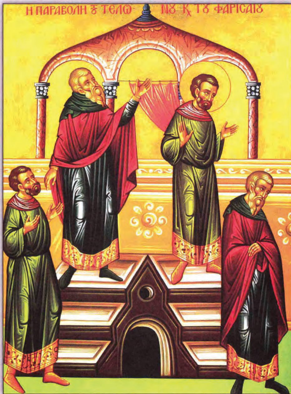
Icon of the Publican and Pharisee