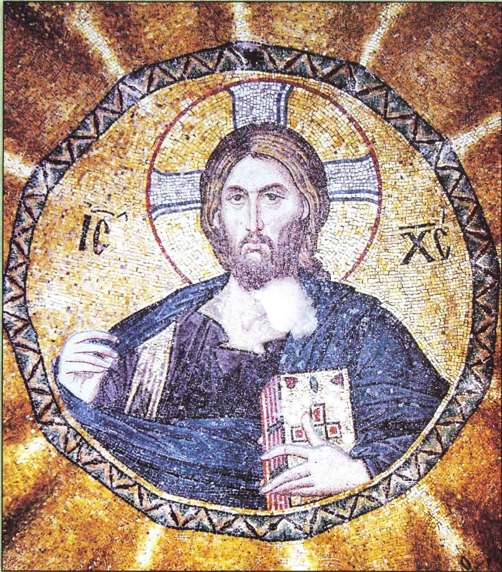
Icon of Christ Pantocrator