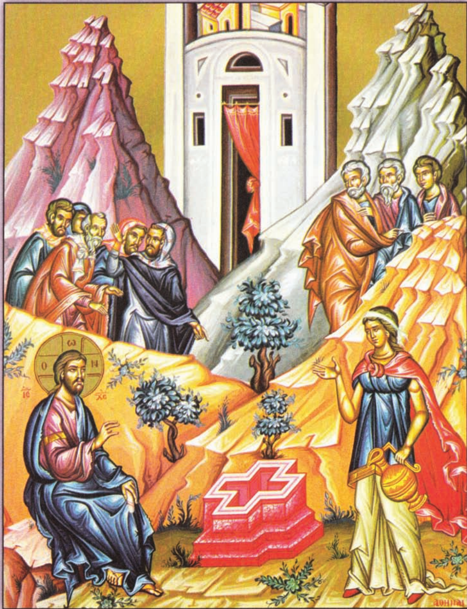
Icon of Christ and the Samaritan Woman