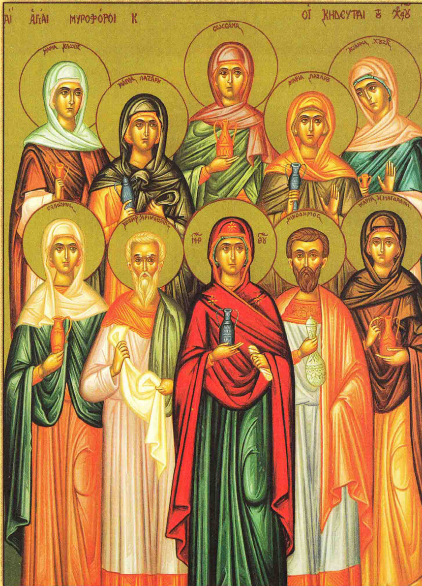
Icon of the Myrrh-bearing Women