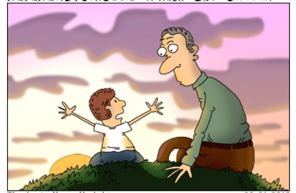
IF GOD CREATED ALL THIS DOES HE HAVE TO PAY THE ELECTRIC BILL TOO?