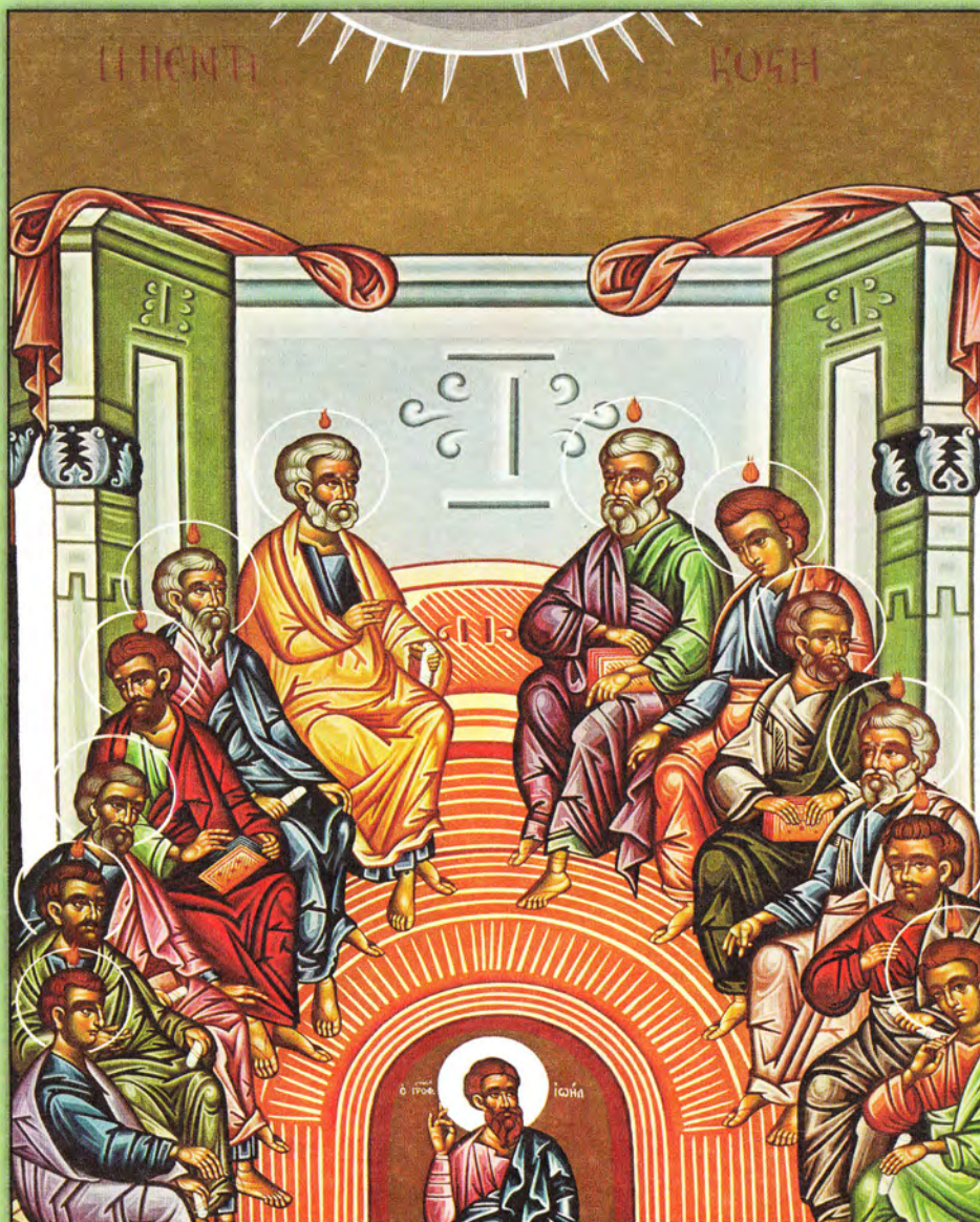
Icon of Pentecost