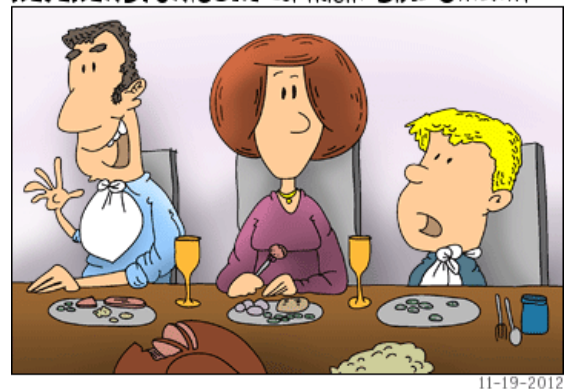
I WOULD BE ABLE TO GIVE A LOT MORE THANKS IF I DIDN'T HAVE TO FINISH OFF THESE LIMA BEANS