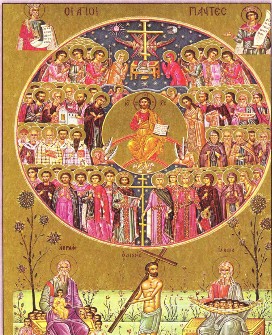
Icon of All Saints