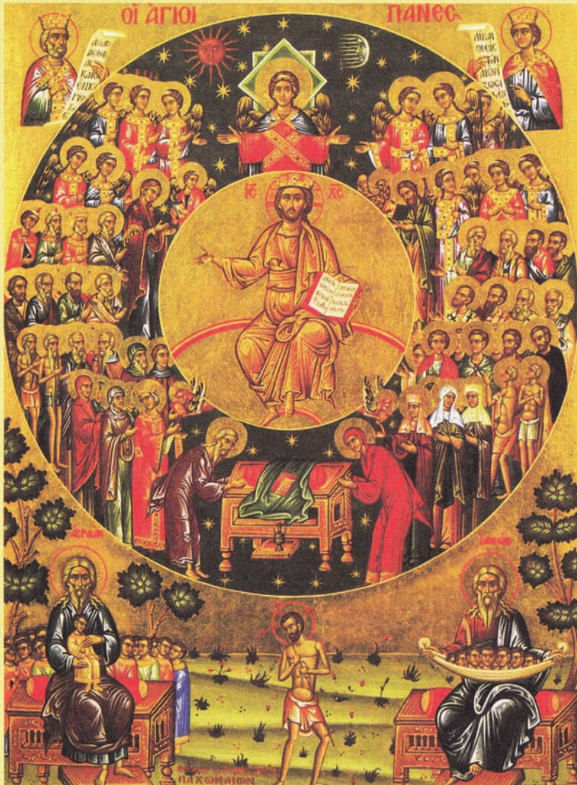
Icon of All Saints