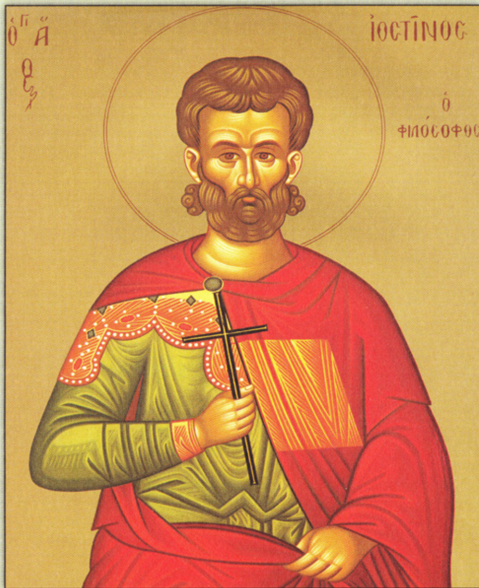
Icon of Saint Justin Martyr -- June 1st