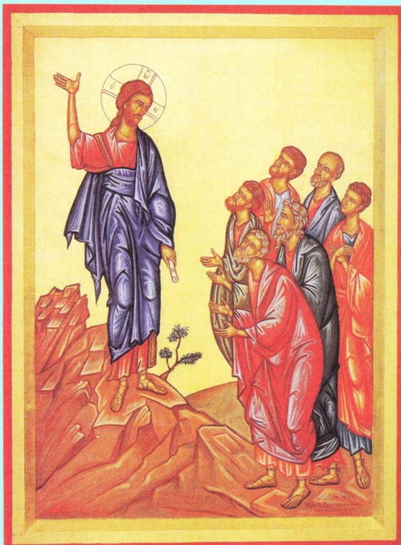
Icon of Christ Teaching the Apostles on the Mount