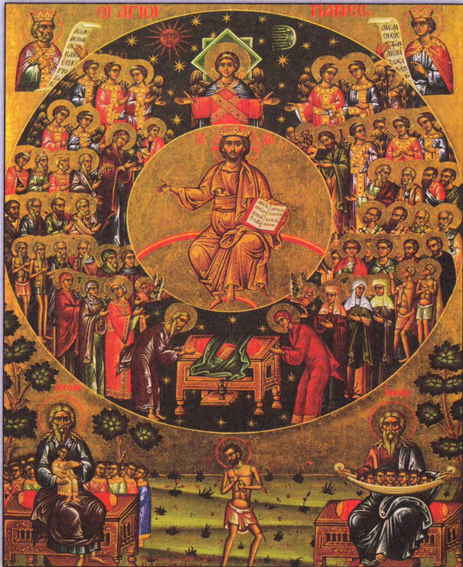
Icon of All Saints