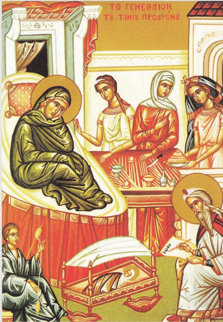
Icon of the Nativity of Saint John the Forerunner -- June 24th