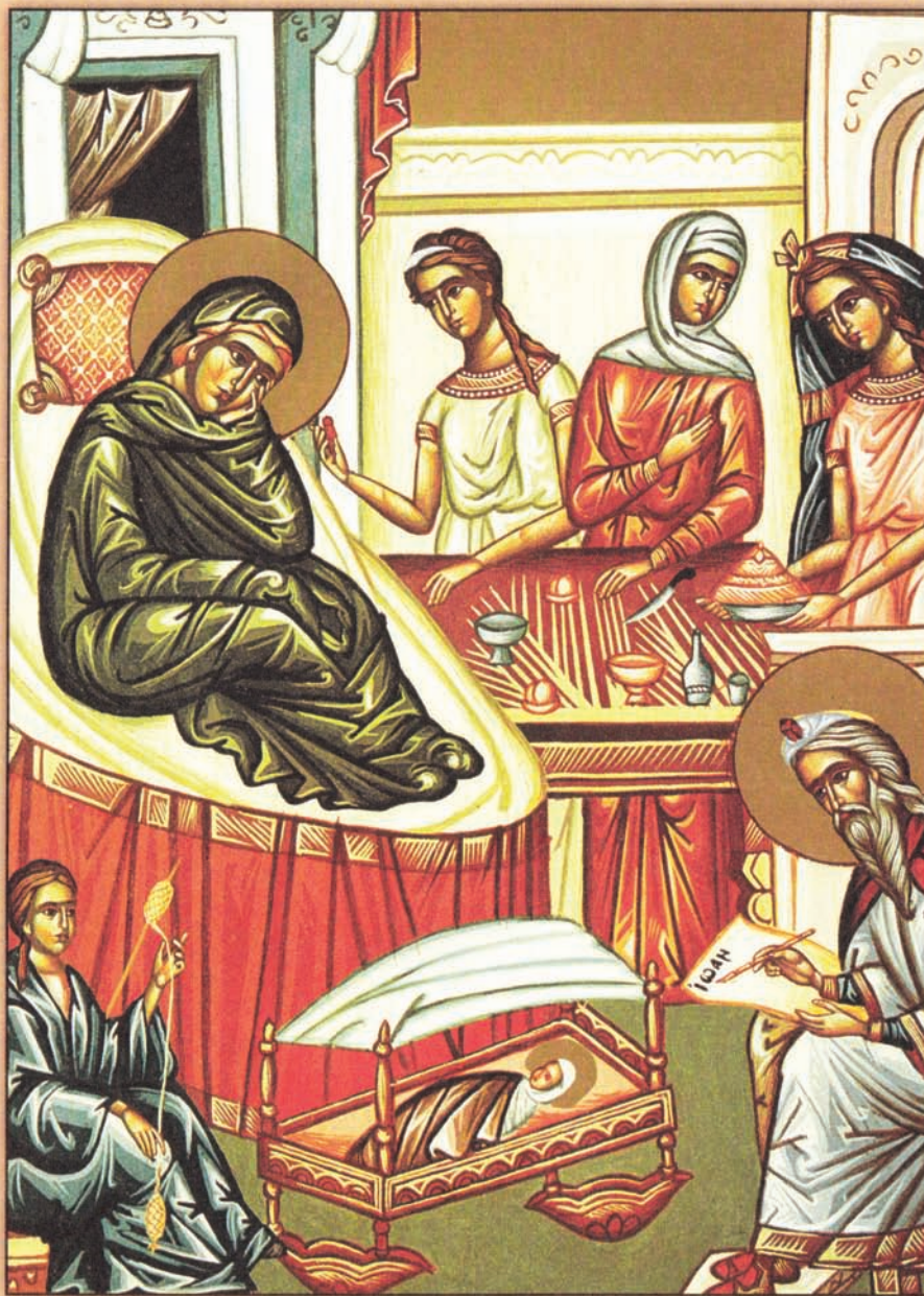
Icon of the Nativity of John the Baptist -- June 24