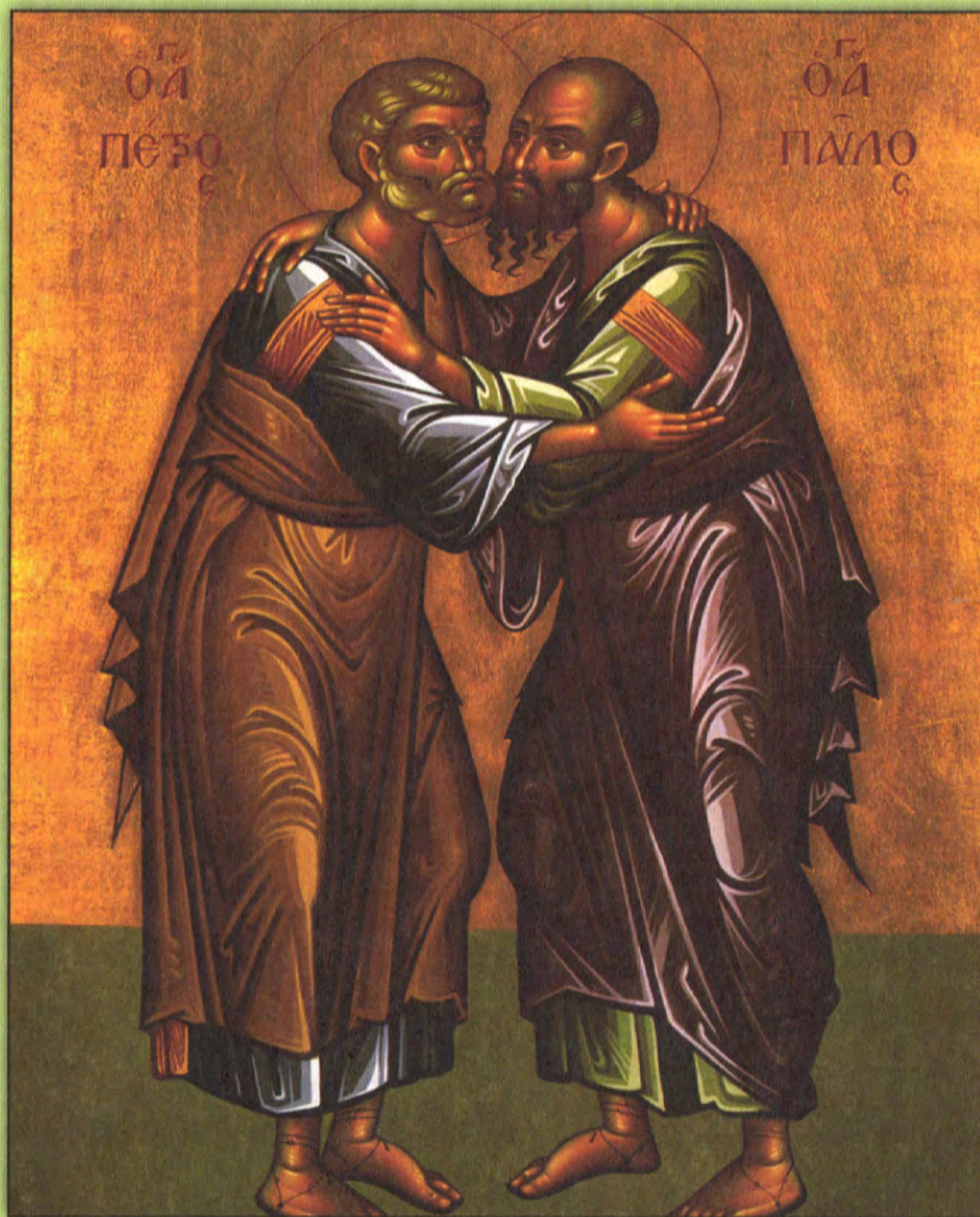
Icon of Saints Peter and Paul -- June 29th