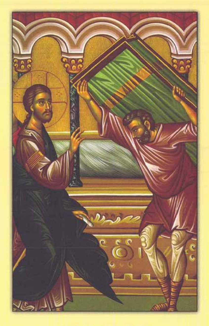
Icon of Healing the Paralytic Man