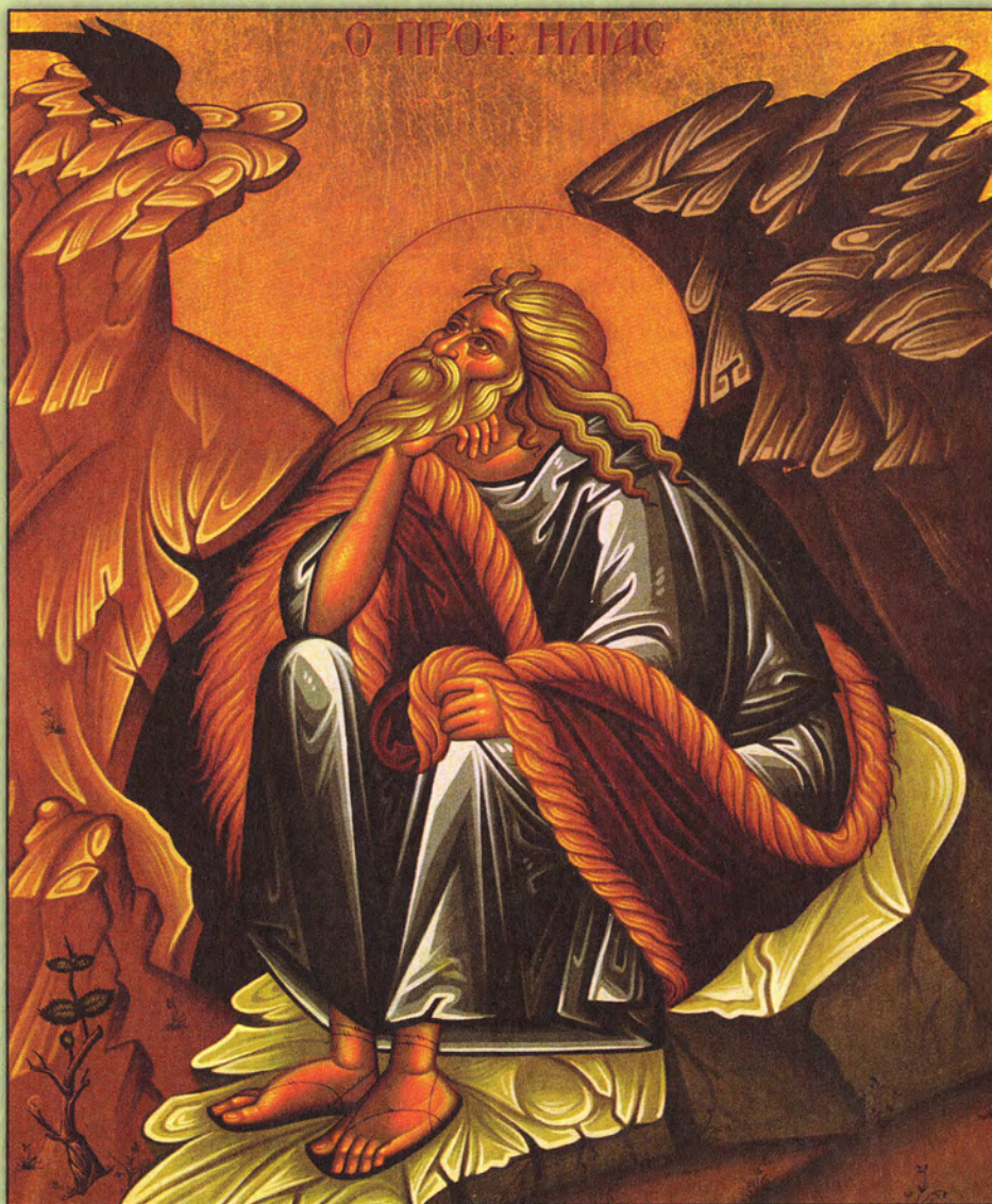
Icon of Saint Elias -- July 20th