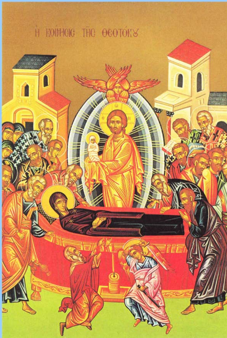
Icon of the Dormition of the Theotokos -- August 15th