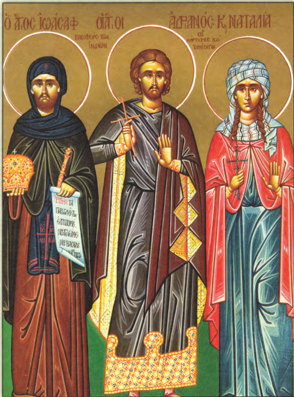
Icon of Saints Adrian, Natalie and Joseph -- August 26th