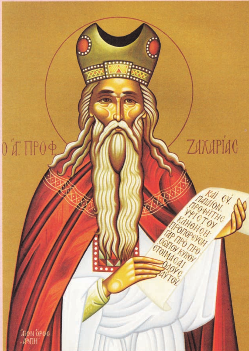
Icon of Zacharias -- September 5th