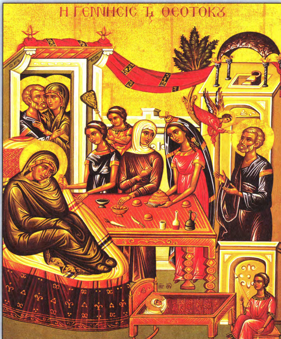
Icon of the Birth of the Theotokos, the Mother of God -- September 8th