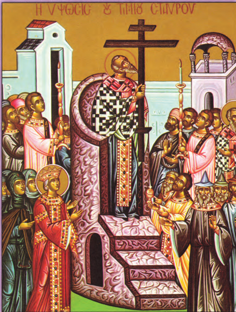
Icon of the Exaltation of the Holy Cross -- September 14th