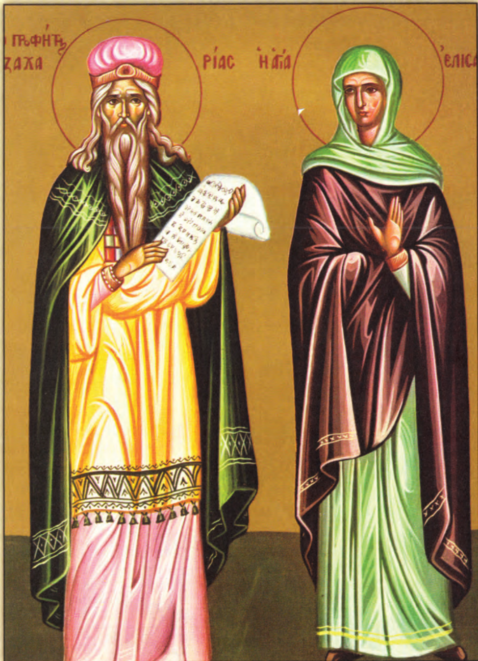
Icon of Zachary and Elizabeth, Conception of St. John the Baptist -- September 23rd