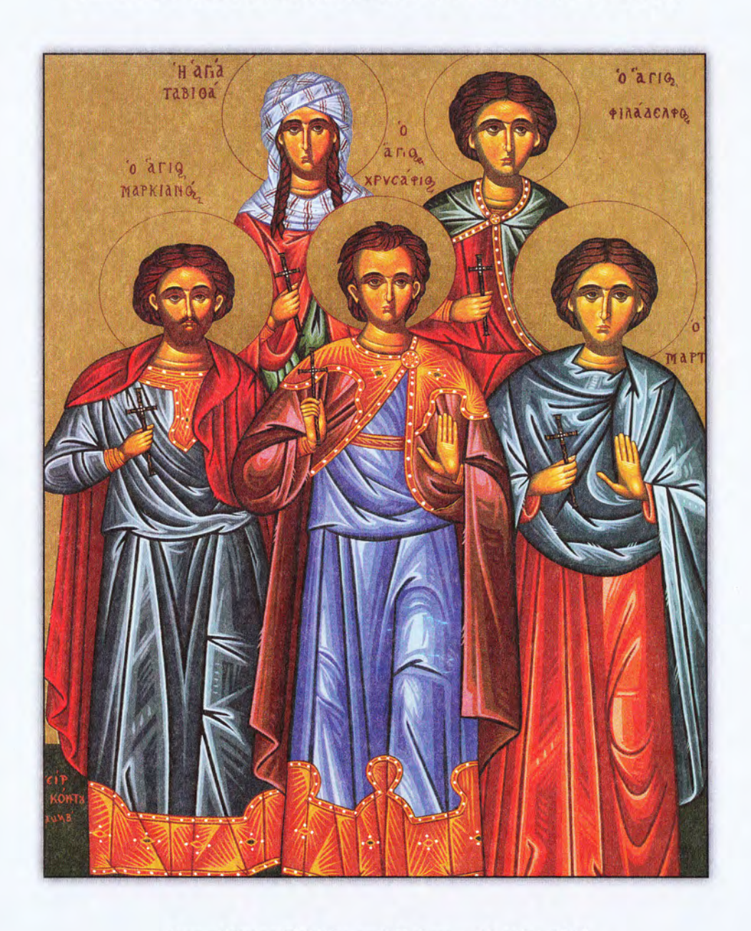
Icon of Saint Tabitha and Others -- October 25th