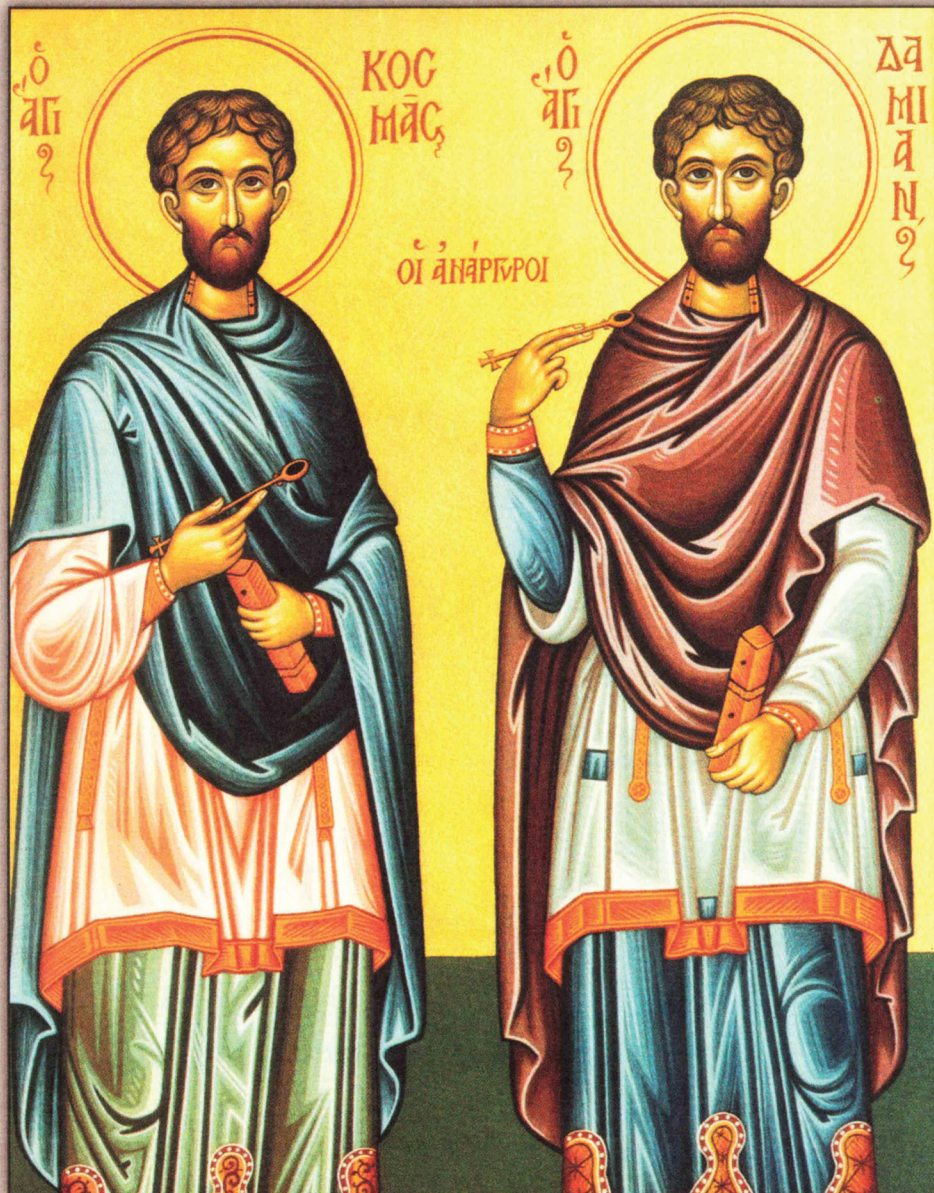
Icon of Cosmas and Damian -- November 1