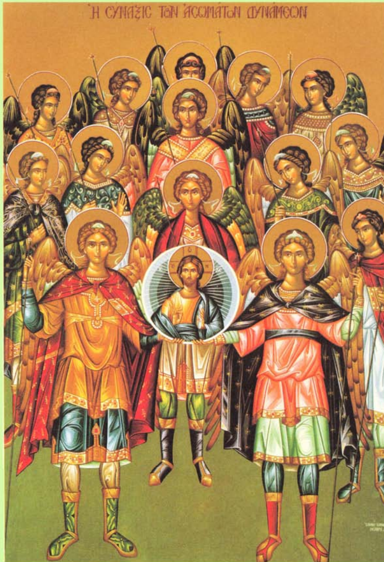
Icon of the Synaxis of the Archangel Michael and all Angelic Powers November 8th