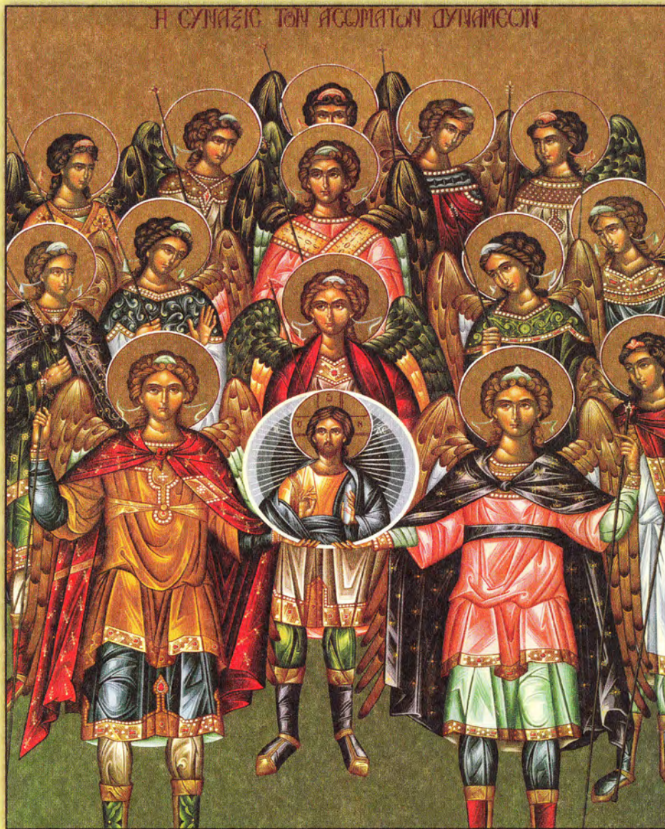
Icon of the Synaxis of the Holy Archangel Michael-- November 8th