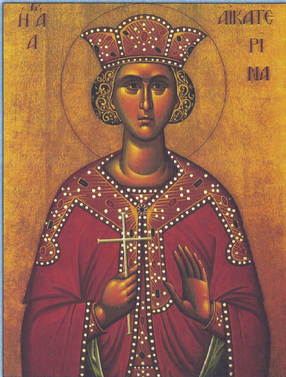
Icon of Saint Catherine of Alexandria -- November 24-25th