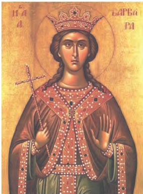
The Great Martyr, Barbara

A saint in the highest tradition of purity and piety, Barbara is listed in some church branches as one of the fourteen auxiliary saints who are sometimes referred to as holy “Helpers,” but she held out so much hope for so many of the faithful in all walks of life that she was adopted by various segments of society as their artillerymen and firemen and just about everyone engaged in hazardous occupations. She is regarded by some as the safeguard against sudden death.