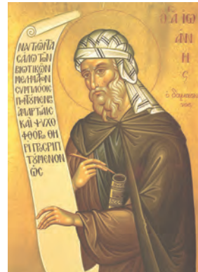
St. John of Damascus - defender of Icons

In times past, God, without body and form, could in no way be represented. But now, since God has appeared in the flesh and lived among men, I can depict that which is visible of God...[for Christ is “the image of the invisible God. (Col. 1:15.)] I do not venerate the matter but I venerate the Creator of matter, Who became matter for me, Who condescended to live in matter, and Who, through matter accomplished my salvation; I do not cease to respect the matter through which my salvation is accomplished.