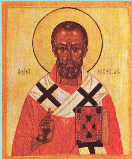
Saint Nicholas the Wonderworker