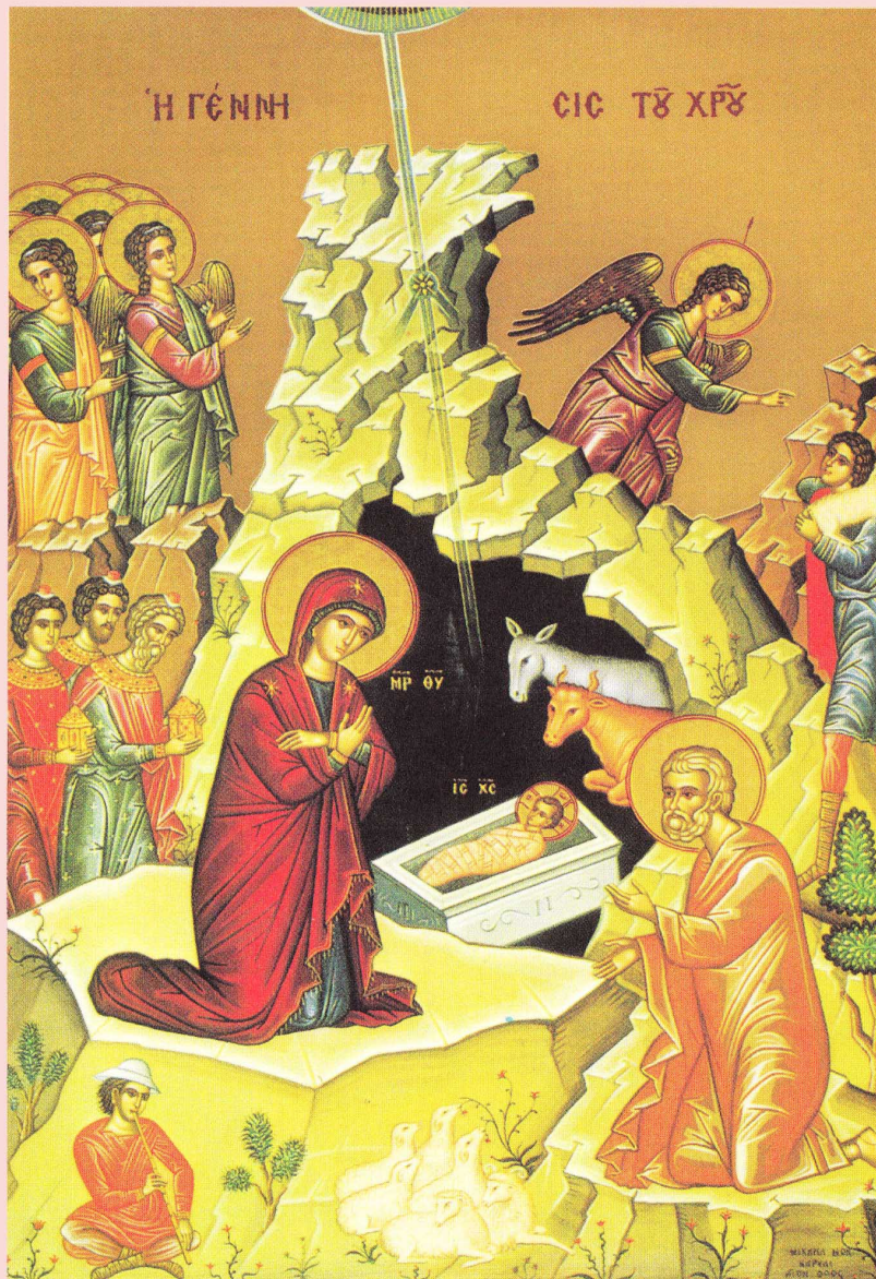
Icon of the Nativity of Our Lord