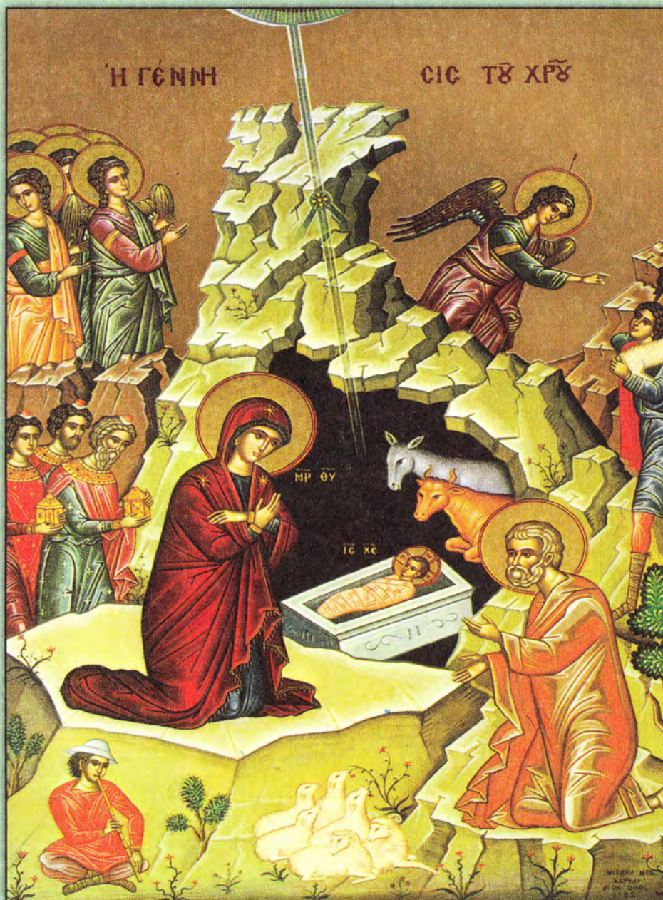
Icon of the Nativity of Our Lord