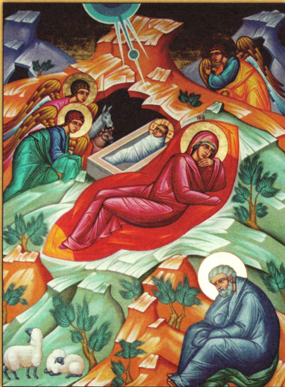
Icon of the Nativity of Our Lord