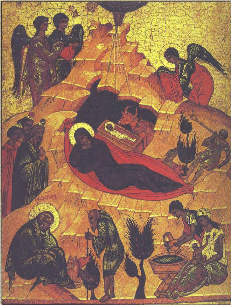
Icon of the Nativity -- December 25th